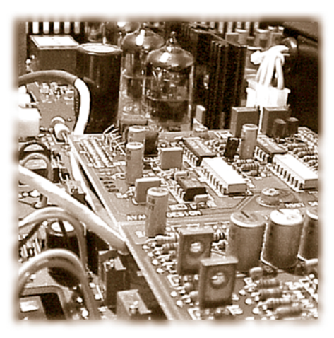
Military tubes and discrete components